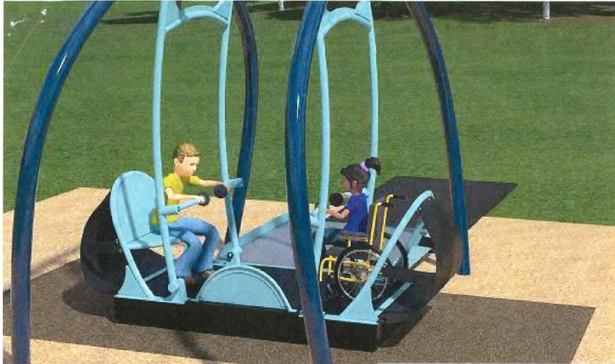
Rendering of a ABC Recreation wheelchair swing to be installed in Heritage Green